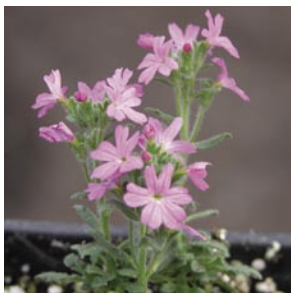
alpinus 'Dr. Haehnle' zones 4–8 · ○ ERIDH Bright red flowers bloom over loose, mat-forming foliage from May-July. Grows 6".