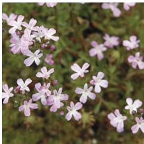
alpinus 'Picos de Europa' zones 4–10 · ○ ERIPE Minute leaves with light pink flowers on 2" prostrate stems. Flower spikes appear in May and often later.