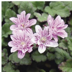
x variabile 'Flore-Pleno' zones 4–8 · ○ ● EROFP Tidy little groundcover featuring perfect little, star-shaped, soft pink double flowers, 2" tall, all summer long.