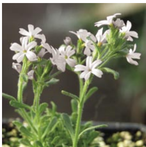
alpinus var. albus Alpine Balsam zones 4–7 · ○ ERIAA A low-growing plant that has narrow fan-shaped to wedge-shaped sticky leaves. The flowers are short white racemes that bloom from late spring to early summer.