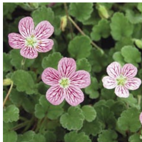
x variabile 'Roseum' zones 4–8 · ○ ● ERORO A showy geranium relative, this 2" tall, flat, mat-forming plant is always in bloom with pale pink blossoms and darker veins. Lovely alpine or trough plant which also works well in containers and with drier annuals. Not reliably hardy in most garden situations.